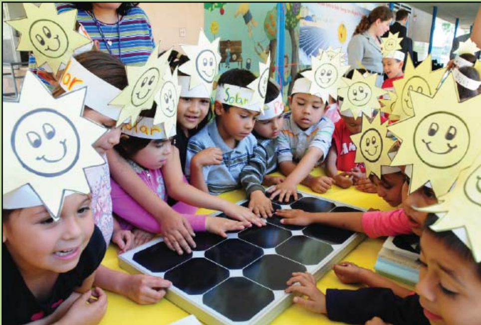
Students at El Dorado Avenue Elementary School got a lesson in how solar panels will convert energy from the sun to power their school.

With a goal of 50 MW (megawatt) installed and online by the close of the 2012 fiscal year, LAUSD has one of the most ambitious solar energy policies and programs of any major public agency in the United States.