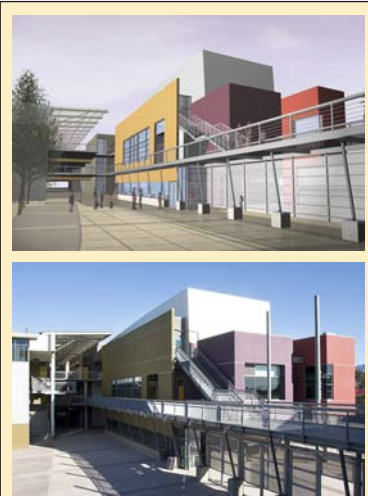
Roy Romer MS, also known as East Valley Area New MS #1, was completed on December 18, 2007