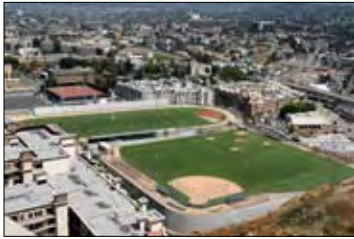
Play fields at Miguel Contreras Learning Complex, previously known as Central LA Area New HS #10