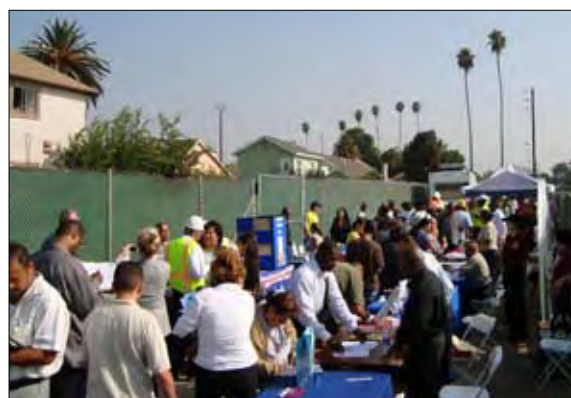
Participants in “We Build” Job Fair event

This extra safety training maximizes “We Build” graduate performance and commitment to safety on the construction site, which equally benefits students, contractors and LAUSD.