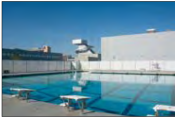
Swimming pool at Central LA Area New HS #9