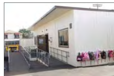
Coeur D'Alene ES FDK