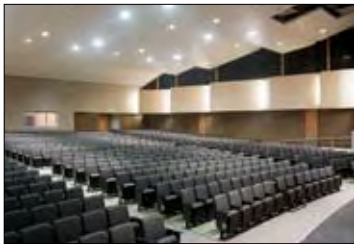
Helen Bernstein HS, previously known as Central LA Area New HS #1, opened on September 2, 2008