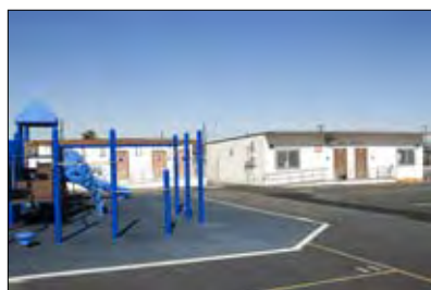
186th St. ES FDK

Implementation of full-day kindergarten has been achieved at 475 schools that currently contain a kindergarten curriculum. This is 15 more schools than the original Board-approved plan.