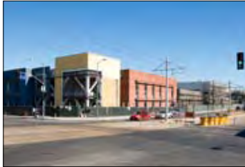
East LA Area New HS #1 (above) and Valley Region EEC #1 (below) are scheduled to open in Fall of 2009, a year earlier than previously anticipated.