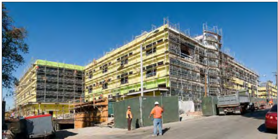
Central Region ES #19 and EEC is scheduled to open in Fall of 2009, a year earlier than previously anticipated.